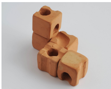
Prototype of the cuboro marble track system, made of clay in 1976