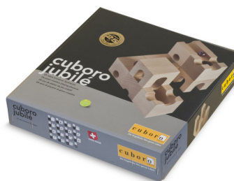
The classy basic set "cuboro jubilé" is available in 2011 in limited edition at specialized stores.